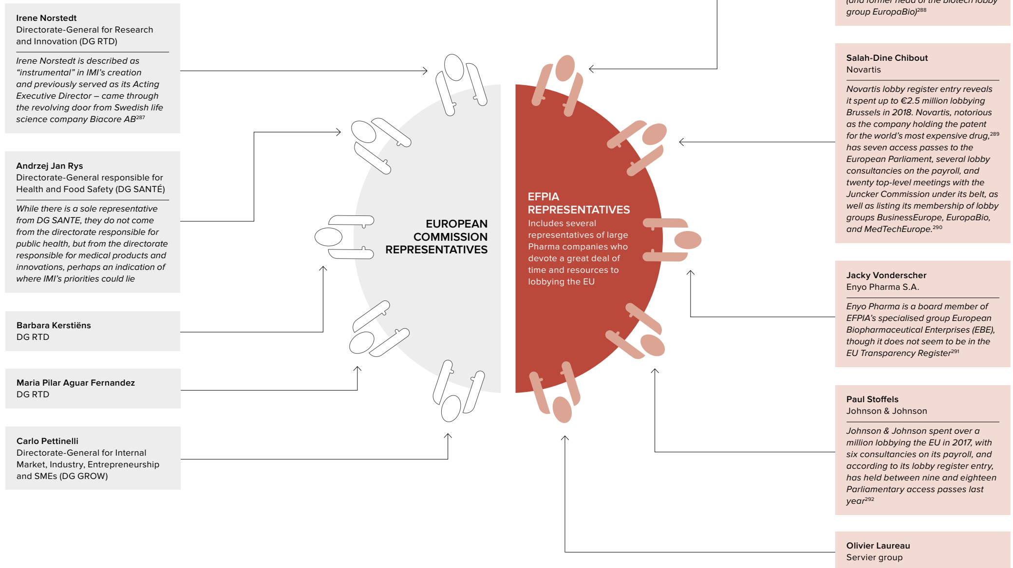
Figure 2: The make-up of IMI's Governing Board 286